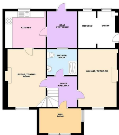
GROUND FLOOR APPROX. 77.0 SQ. METRES (829.3 SQ. FEET)